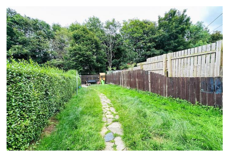
CLYDE PLACE, CAMBUSLANG, GLASGOW OFFERS OVER £80,000