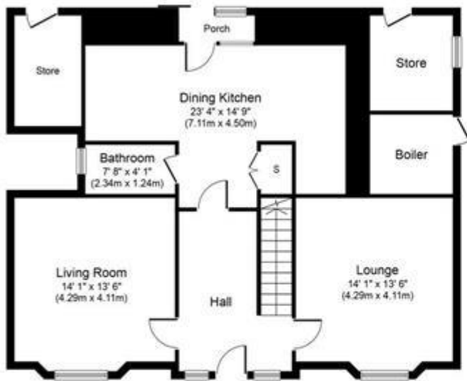
Ground Floor Approximate Floor Area 1,027 sq.ft. (95.4 sq.m.)