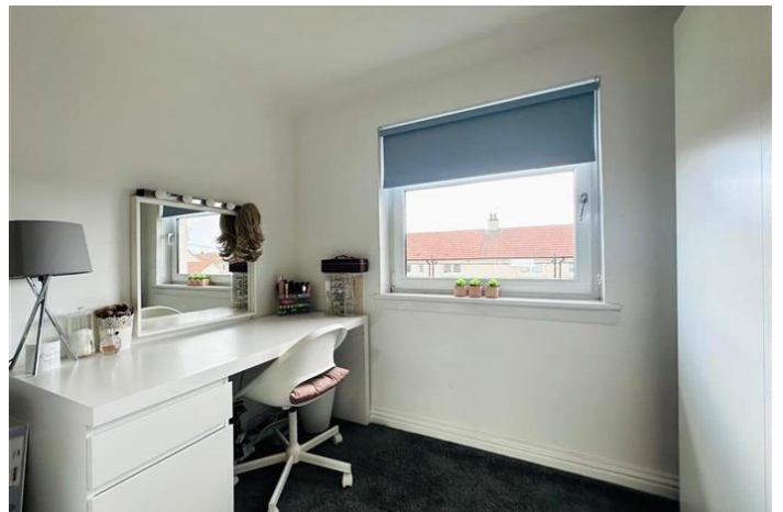
NORTH CALDER ROAD, UDDINGSTON, GLASGOW OFFERS OVER £115,000