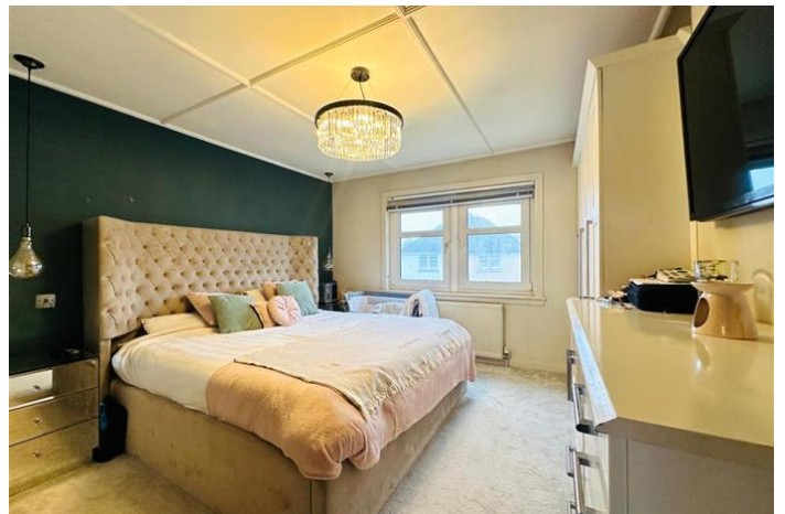
WOODLANDS CRESCENT, BOTHWELL, GLASGOW OFFERS OVER £210,000