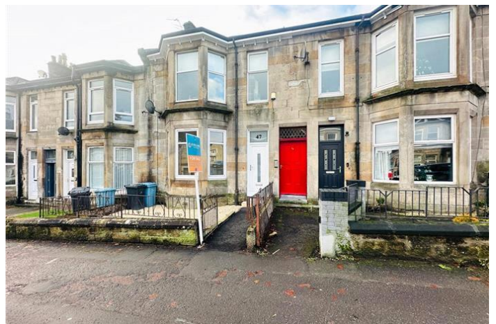
CORSEWALL STREET, COATBRIDGE OFFERS OVER £85,000