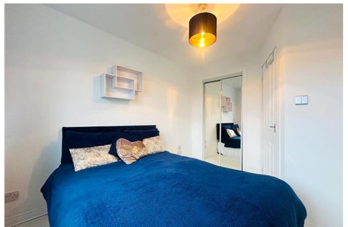
KIRKWOOD PLACE, COATBRIDGE £1,295 PCM