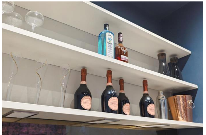
THE GLADES, GLEBE WYND, BOTHWELL, GLASGOW FROM £749,000