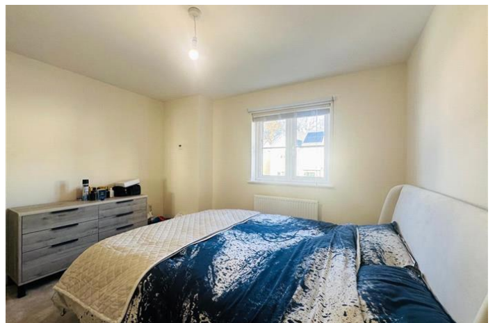
HIGHBURY GROVE, EAST KILBRIDE, GLASGOW OFFERS OVER £310,000