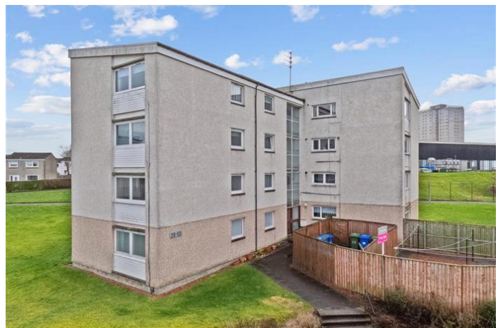
THORNDYKE, EAST KILBRIDE, GLASGOW OFFERS OVER £85,000