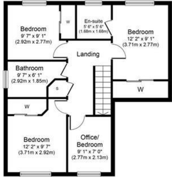
First Floor Approximate Floor Area 607 sq. ft. (56.4 sq. m.)

Whilst every attempt has been made to ensure the accuracy of the floor plan contained here, measurements of doors, windows, rooms and any other items are approximate and no responsibility is taken for any error, omission, or mis-statement. The measurements should not be relied upon for valuation, transaction and/or funding purposes. This plan is for illustrative purposes only and should be used as such by any prospective purchaser or tenant. The services, systems and appliances shown have not been tested and no guarantee as to their operability or efficiency can be given.