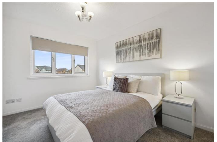
CHERRY GROVE, BARGEDDIE, GLASGOW OFFERS OVER £279,995 Freehold