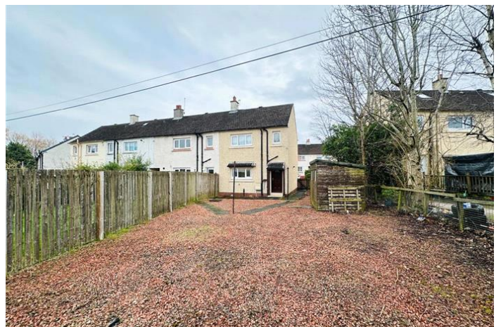
ST. BRIDES WAY, BOTHWELL, GLASGOW £895 PCM