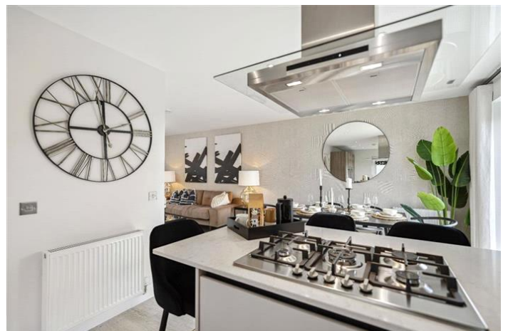
PLOT 13 BLAIRHILL GARDENS, BLAIR ROAD, COATBRIDGE FIXED PRICE £379,000 Freehold