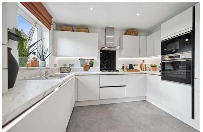
PLOT 19 BLAIRHILL GARDENS, BLAIR ROAD, COATBRIDGE FIXED PRICE £264,000 Freehold