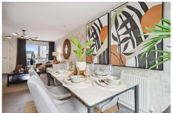
PLOT 22 BLAIRHILL GARDENS, BLAIR ROAD, COATBRIDGE FIXED PRICE £264,000 Freehold