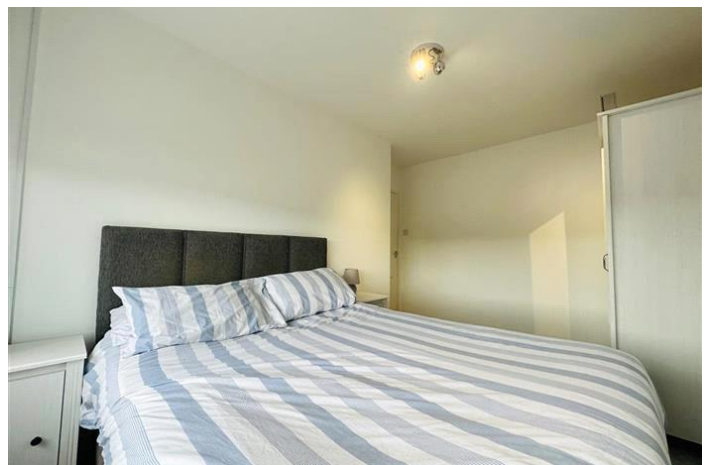
THE OVAL, GLENBOIG, COATBRIDGE OFFERS OVER £125,000 Freehold