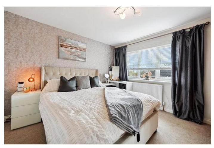
LUGGIEBURN WALK, COATBRIDGE, NORTH LANARKSHIRE, ML EE,