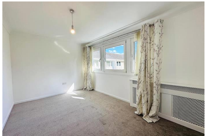
MARY SQUARE, BARGEDDIE, GLASGOW OFFERS OVER £112,500