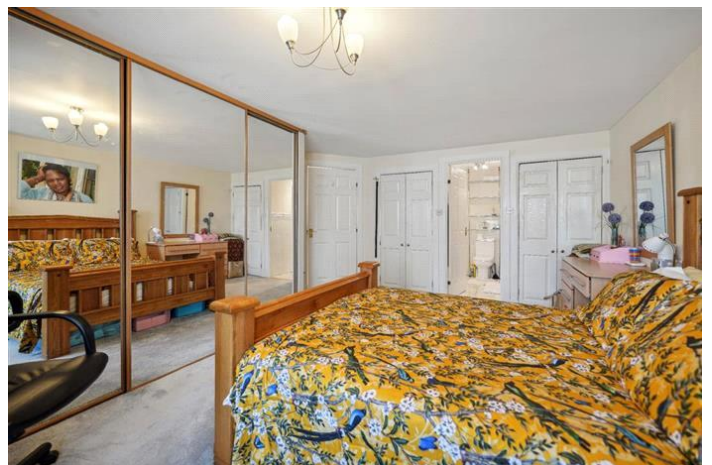
THE FAIRWAYS, BOTHWELL, GLASGOW OFFERS OVER £260,000