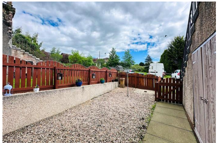
WEIR STREET, COATBRIDGE OFFERS OVER £99,995