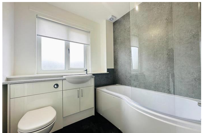
NEILSON STREET, BELLSHILL £950 PCM