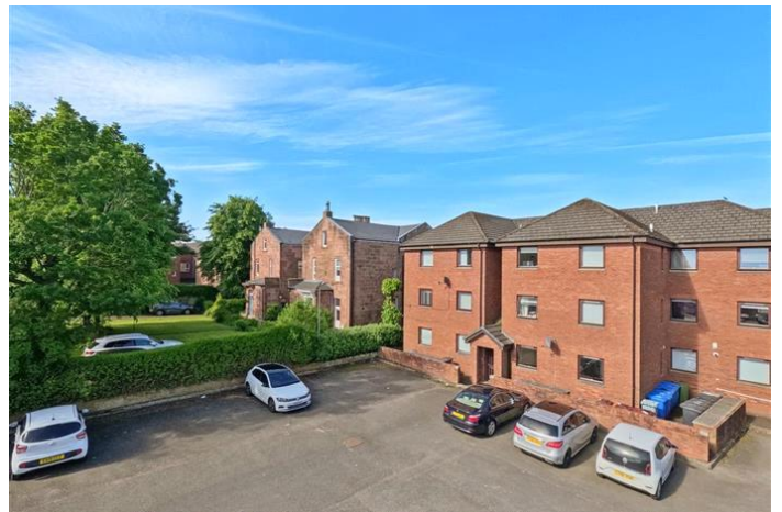
FLAT , CHALMERS COURT, MAIN STREET, UDDINGSTON, GLASGOW OFFERS OVER £135,000