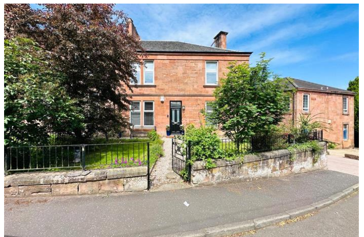
LANGSIDE ROAD, BOTHWELL, GLASGOW £1,095 PCM