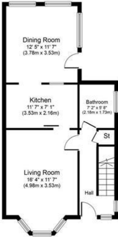
Ground Floor Approximate Floor Area 536 sq. ft. (49.8 sq. m.)