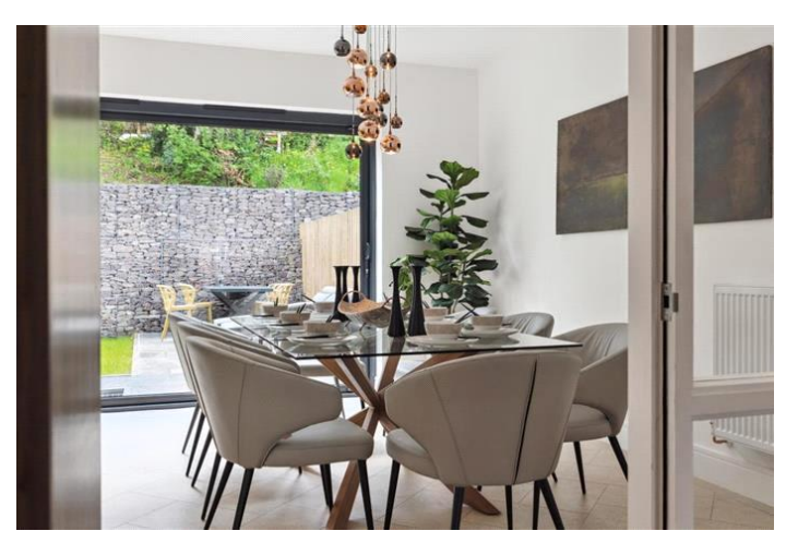
GLEBE WYND, BOTHWELL, GLASGOW OFFERS OVER £799,995