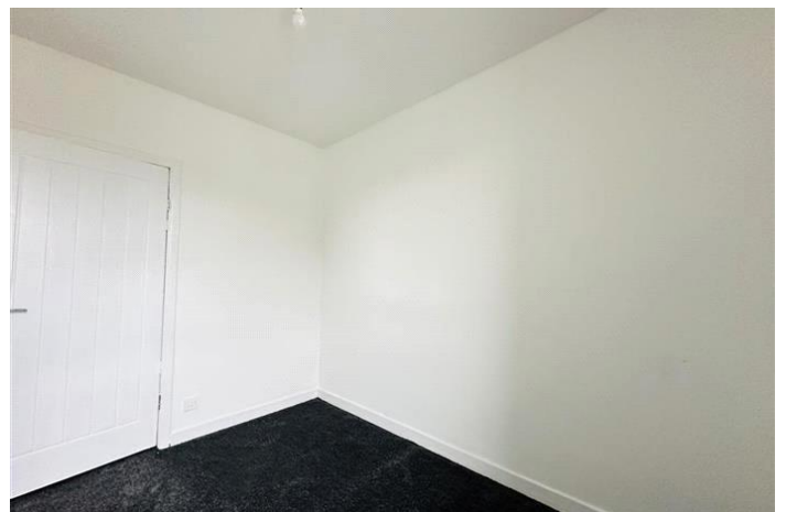
WEST KIRK STREET, AIRDRIE £650 PCM