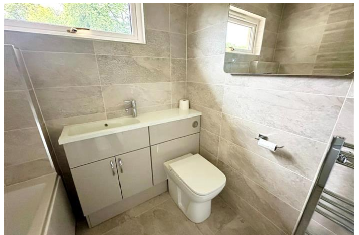
GLENEAGLES PARK, BOTHWELL, GLASGOW £1,450 PCM