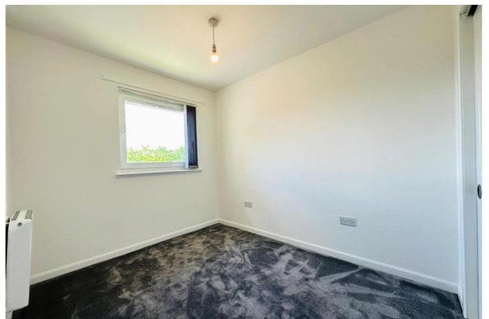
FAIRWAYS DRIVE, KIRN, DUNOON £900 PCM