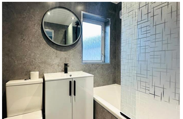
BANYAN CRESCENT, UDDINGSTON, GLASGOW OFFERS OVER £125,000